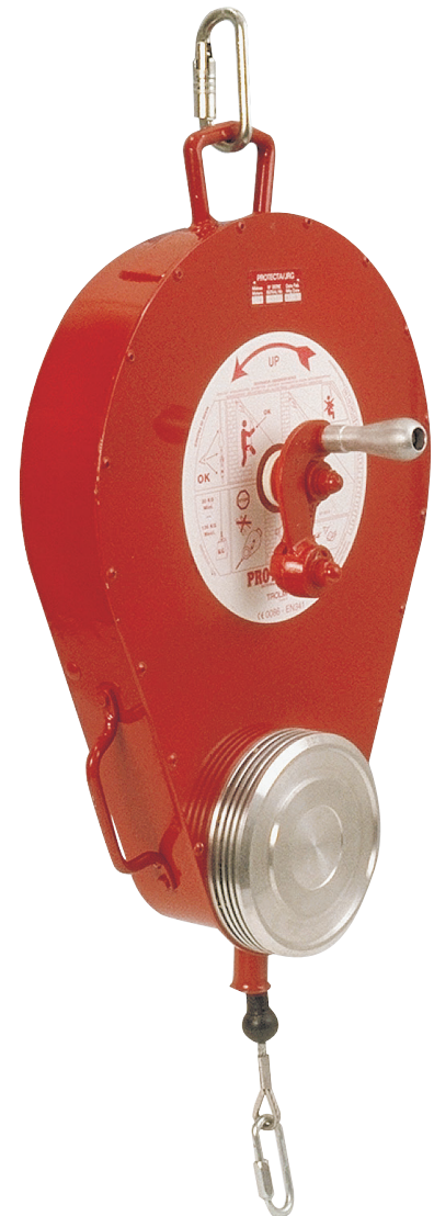
AG300 Evacuation carriage with braking system